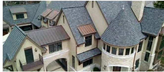
Elm Grove Castle, Elm Grove, Wisconsin Brennan Exteriors, LLC.

Located in El Paso, Texas, this beautiful home's 6,000-square-foot roof was damaged by a large hailstorm. The previous roof, a 30-year-old asphalt shingle system, had proven its ability to serve a long and tenacious lifecycle, so the owners decided to replace with new asphalt shingles instead of tile options. For the job, HAC Construction installed PABCO Cascade™ shingles in the color Pewter Gray alongside a PABCO Shasta high definition ridge.