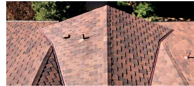
Littleton, Colorado Advanced Construction Roofing

After 30 years, the original dimensional asphalt shingles on this 4,437-square-foot roof were damaged beyond repair by a fierce hailstorm. The owners of this Littleton, Colorado home immediately opted to replace with a modern asphalt shingle system. Advanced Construction Roofing installed Malarkey Windsor® polymer modified asphalt shingles with a Class 4 impact resistance rating to help protect against damage from future hailstorms and provide an attractive, elegant design.