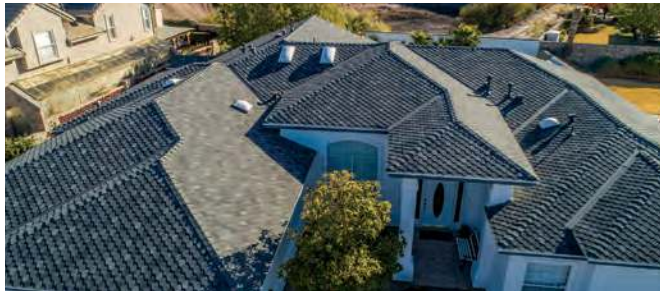
Casa de Lupita Diamond Gate, El Paso, Texas HAC Construction

Located in El Paso, Texas, this beautiful home's 6,000-square-foot roof was damaged by a large hailstorm. The previous roof, a 30-year-old asphalt shingle system, had proven its ability to serve a long and tenacious lifecycle, so the owners decided to replace with new asphalt shingles instead of tile options. For the job, HAC Construction installed PABCO Cascade™ shingles in the color Pewter Gray alongside a PABCO Shasta high definition ridge.