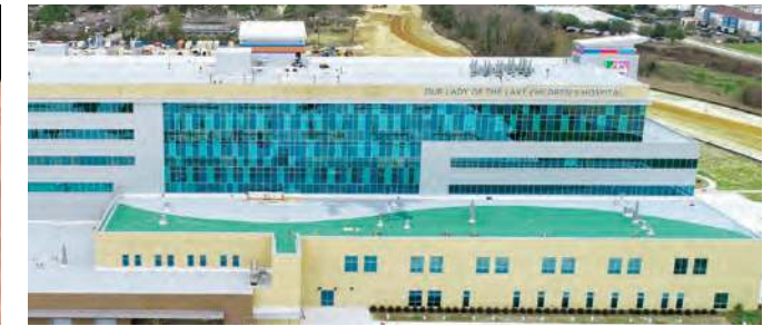
Our Lady of the Lake Children's Hospital, Baton Rouge, Louisiana Roofing Solutions, LLC.

After 30 years, the original dimensional asphalt shingles on this 4,437-square-foot roof were damaged beyond repair by a fierce hailstorm. The owners of this Littleton, Colorado home immediately opted to replace with a modern asphalt shingle system. Advanced Construction Roofing installed Malarkey Windsor® polymer modified asphalt shingles with a Class 4 impact resistance rating to help protect against damage from future hailstorms and provide an attractive, elegant design.