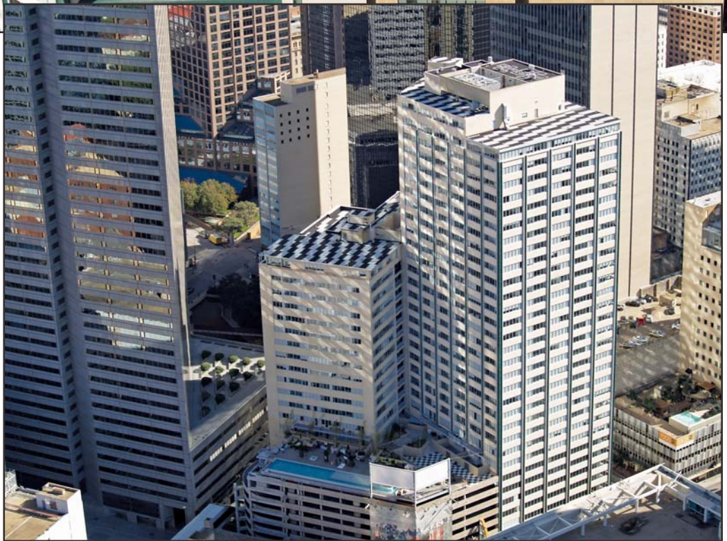
This downtown Dallas building was renovated into luxury condos. The developers wanted it to be seen by the high-rise buildings around it. Construction: Iso set in OlyBond 500, Liberty SA, SBS heat-weld 25, SBS heat-weld FR seen as white, Torch Plus FR seen as black.

“Tear strength, tensile strength, and impact resistance are common criteria we are asked to determine and evaluate. Test methods vary by material for evaluation of similar properties. An aggregate-surfaced BUR exhibits a significantly higher impact resistance than a TPO membrane under similar conditions. A two-ply modified bituminous membrane roofing system will also demonstrate this better impact resistance. The tensile properties of BUR glass fiber felt roofing systems also demonstrate high tensile values and fairly low elongation. The low elongation is offset by the high tensile [properties]. Modified bituminous two-ply membrane systems – especially the polyester reinforced systems – demonstrate high tensile and elongation [properties]. The tear resistance of both BUR and modified bituminous roofing systems are high, as well.”